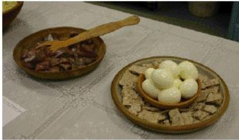
Herring, Eggs and Flatbread