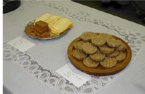
Cheese and Oatcakes