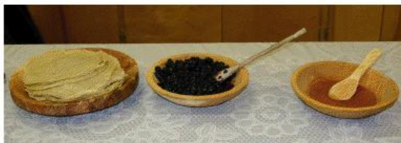
Flatbread, Blueberries, Honey