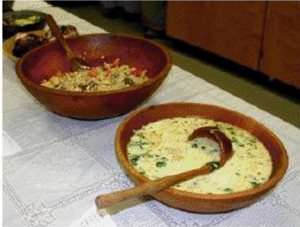
Mutton Stew and Fish Stew