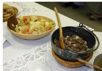
Honey Glazed Vegetables, Elk Stew