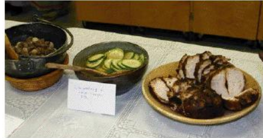
Elk Stew, Cucumbers, Roast Pork